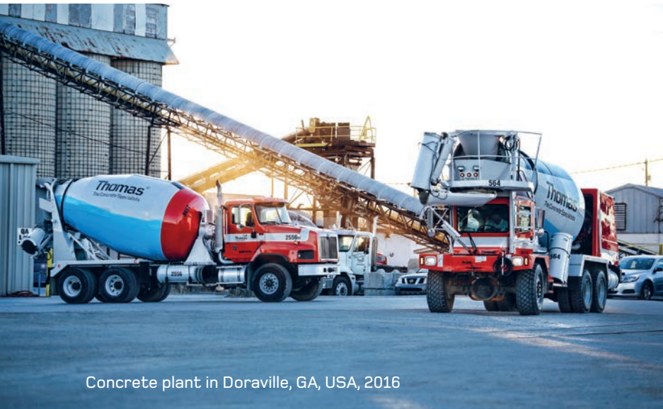
Concrete plant in Doraville, GA, USA, 2016