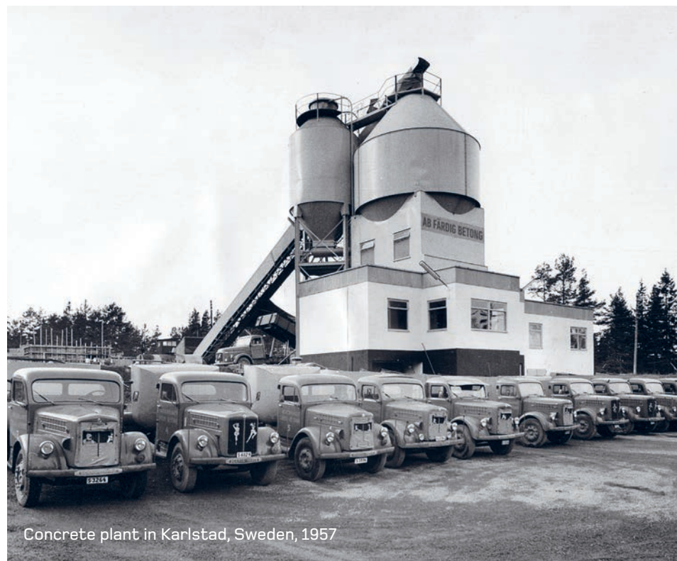
Concrete plant in Karlstad, Sweden, 1957