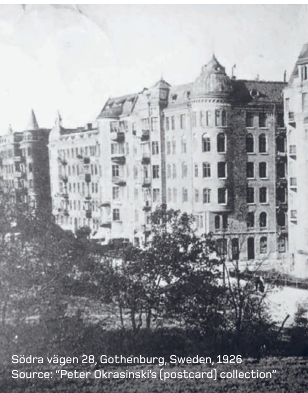
Södra vägen 28, Gothenburg, Sweden, 1926